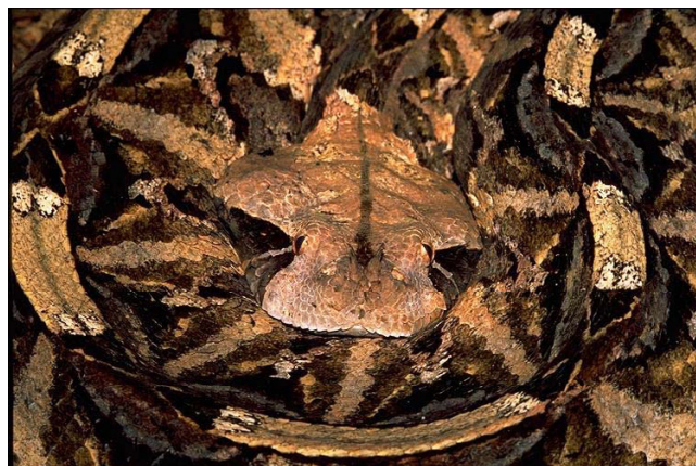
Figure 3 Bitis gabonica .

Snakes are called 'nzoka' and 'thuol' in the Kamba and Luo language respectively. In Kambaland, a number of venomous species were identified: "nzoka ya kiko" or Naja melanoleuca (Fig. 2); the very fierce "yaitha" or Dendroaspis polylepis and 'kimbuwa' or Bitis spp. (Fig. 3) the puff adders. With exception of the spitting cobra, these snakes typically deliver venom through two hollow teeth called fangs; the venom is called 'kiri' in Dholuo and "sumu" in Kikamba . Spitting cobras are notable for visiting settled areas and are reputed to spit venom toward enemies up to 2.5 m away. There was concurrence among the informants that some snake bite cases were caused by malevolent persons.