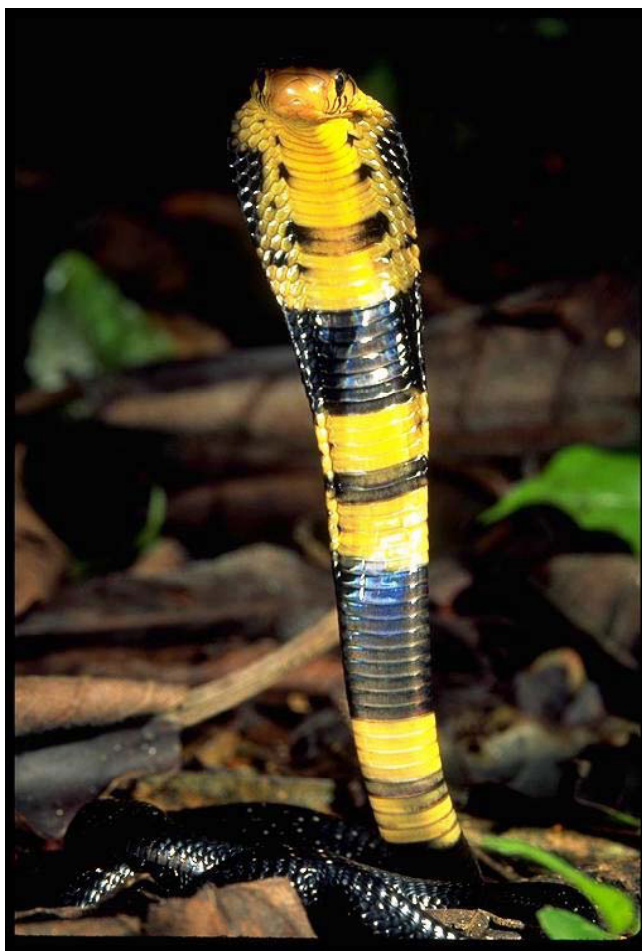
Figure 2 Naja melanoleuca.

education. The information in table 1 is for the total 212 respondents interviewed. In general the more educated respondents had less knowledge on these remedies.