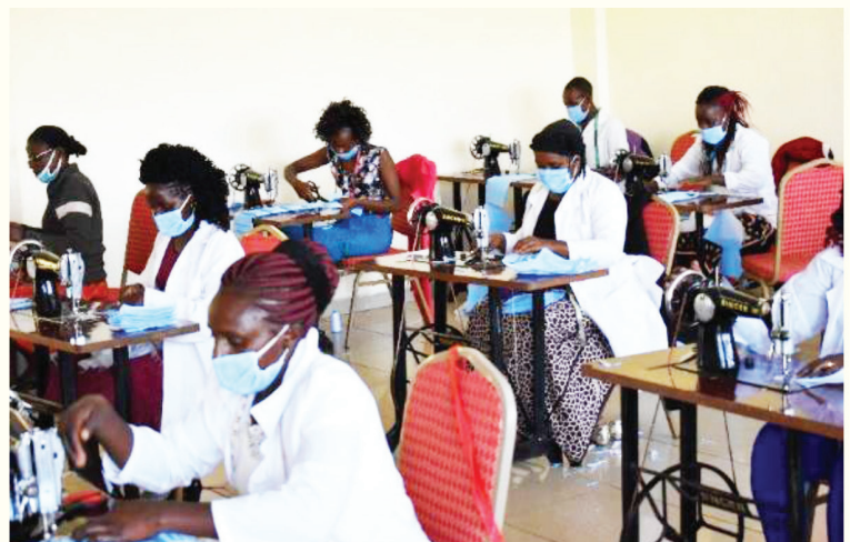
A Team from the tailoring department prepare the SEKU face masks

To augment the University's teaching and research, the buildings at the Wote and Kitui Town campuses, as well as the School of Humanities and Social Sciences at the Main Gate will soon be ready for use.