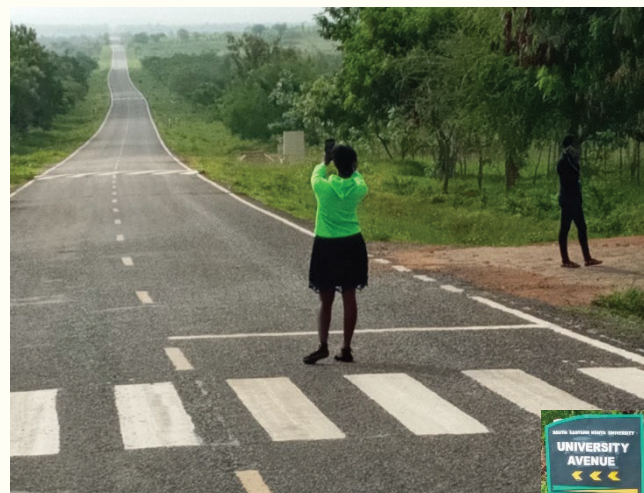
A first year student takes a photo of self on the SEKU Kwa Vonza Road

The road is also a major boost to other stakeholders such as business people, who can now reach the University with ease. The new development has also relieved the staff of the nagging wear and tear on their personal vehicles.