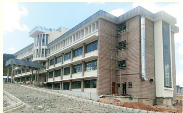
Wote Town Campus building

Located at the Main Campus' main gate, the College of Humanities and Social Sciences is envisaged to house the current School of Education, Humanities and Social Sciences; and the School of Business and Economics. The College is conveniently located to cater for those seeking part time education through weekend or evening classes as it is easily accessible from Kwa-Vonza market.