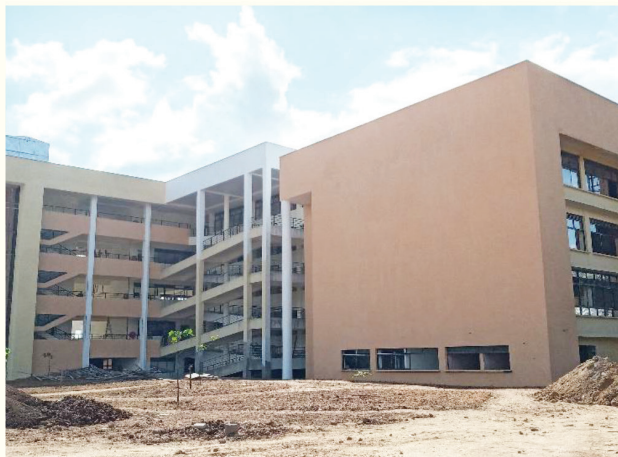
Kitui Town Campus building

The Vice Chancellor said that the impending handing over of the three buildings will be a major boost to the university quest to expand learning facilities for ease of learning.