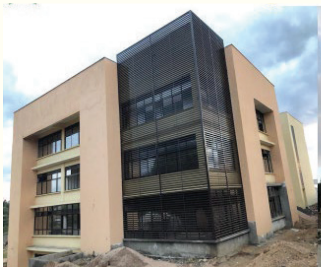
The Kitui Town Campus Administration & Tuition Building