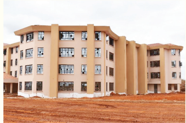
College of Education, Humanities and Social Sciences building