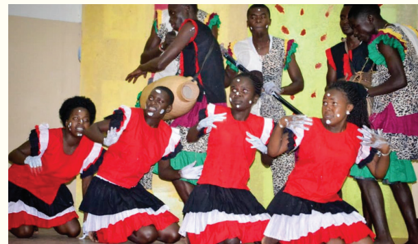
SEKU troupe displays talent in traditional African dance

SEKU was represented in various categories of the competition; Creative Cultural Dance, Modern Dance, Spoken Word, Solo Verse, Stand-up Comedy and Narrative. The SEKU groups staged sterling performances in their categories.