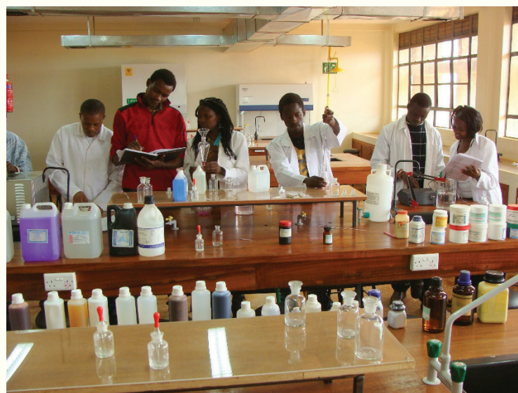
Students in a practical science session