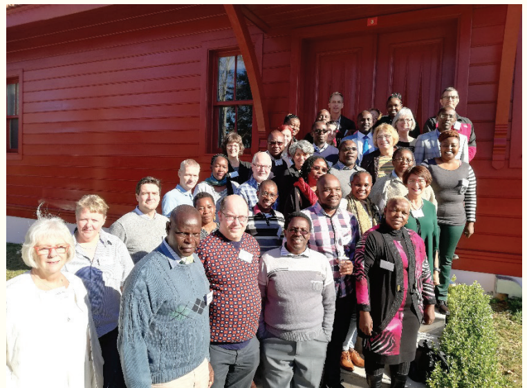
Members of the CPC implementation team during the inaugural meeting in Istanbul, Turkey.

The SEKU director of ICT and the chair of the Hydrology and Aquatic Sciences respectively also attended two other courses directed towards the SEKU having in-house expertise how to Kickstart Your Career: Academic Skills During and after University and embracement of A Multidisciplinary Approach to Artificial Intelligence .