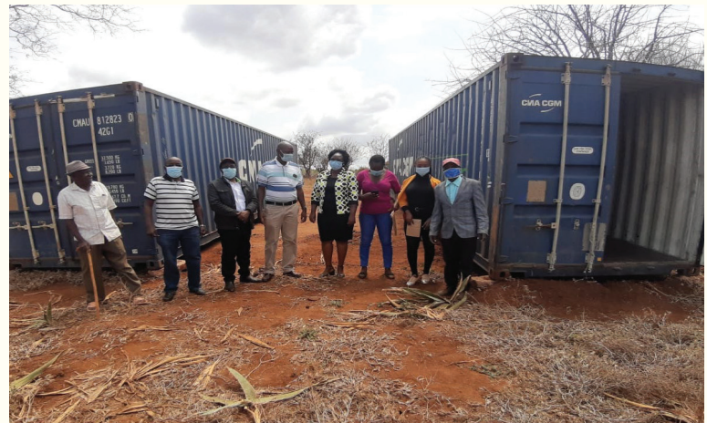
ABOVE: SEKU-ASALI Project team and community leaders inspect containers delivered at the site of the proposed model village. BELOW: Beehives provided by the Project

The ASALI project is also providing twelve (12) bee hives that will introduce apiculture in the area. Training to sustain the Community Village Economic will be carried out by the Sahelian Solutions (SASOL) Foundation and Ducubox in consultation with the ASALI project. For the ICT Centre, the ASALI project has already procured five desk top computers.