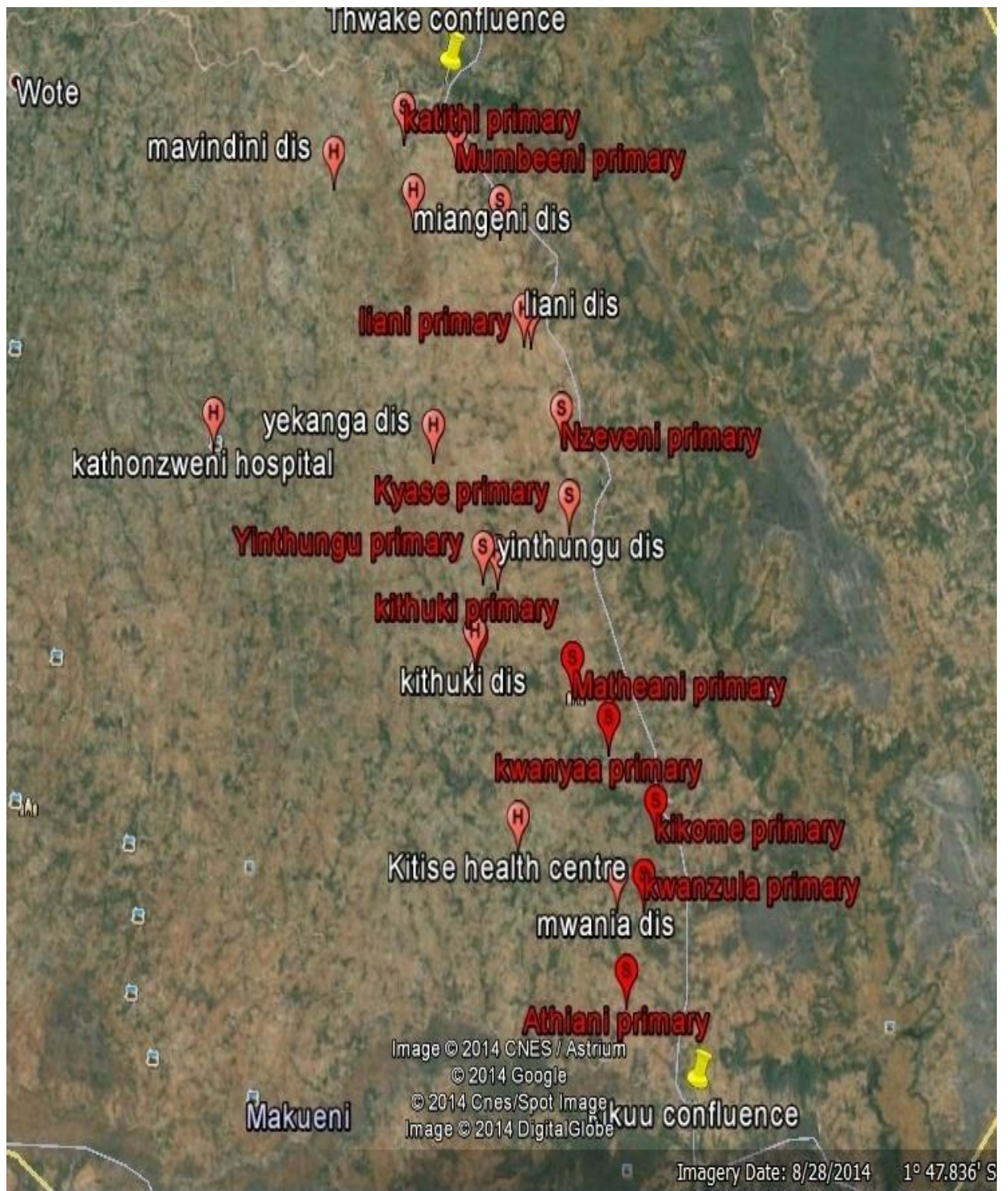
Figure 3.2: Google Earth map of the study site showing sampling of study centres