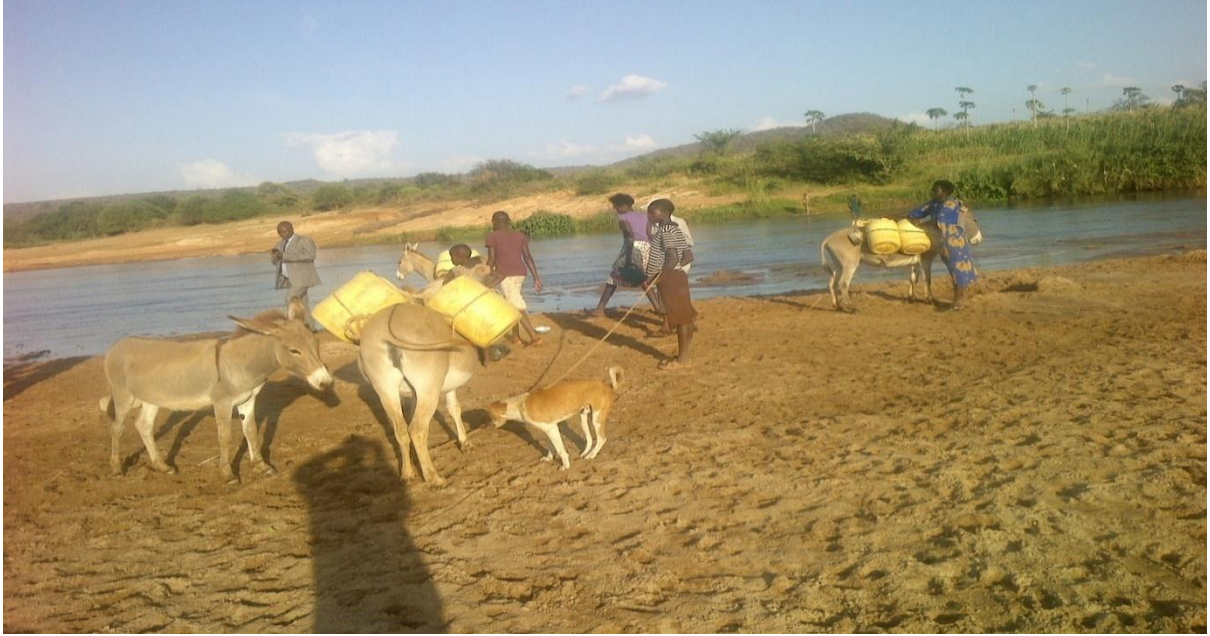
Plate 5.2: Community members fetching water from River Athi (source?)

It was clear that the households in the five villages required the river water for domestic use and irrigation purposes (Abednego et al. , 2013). More-over in Kyase village, the river water was commonly used for cooking. The study indicated that people in all the villages were using the river water for making bricks for house building which was provided affordable to the community house construction materials. Some sold the bricks to supplement their livelihoods options hence proper resource utilization of natural resources to reduce poverty in the area. This confirmed the use of the water for alternative livelihood improvement. Some of the respondents in Kyase and Kikome reported to have been using the river water for fishing. Fishing was found to have been an alternative source of food in all the villages.