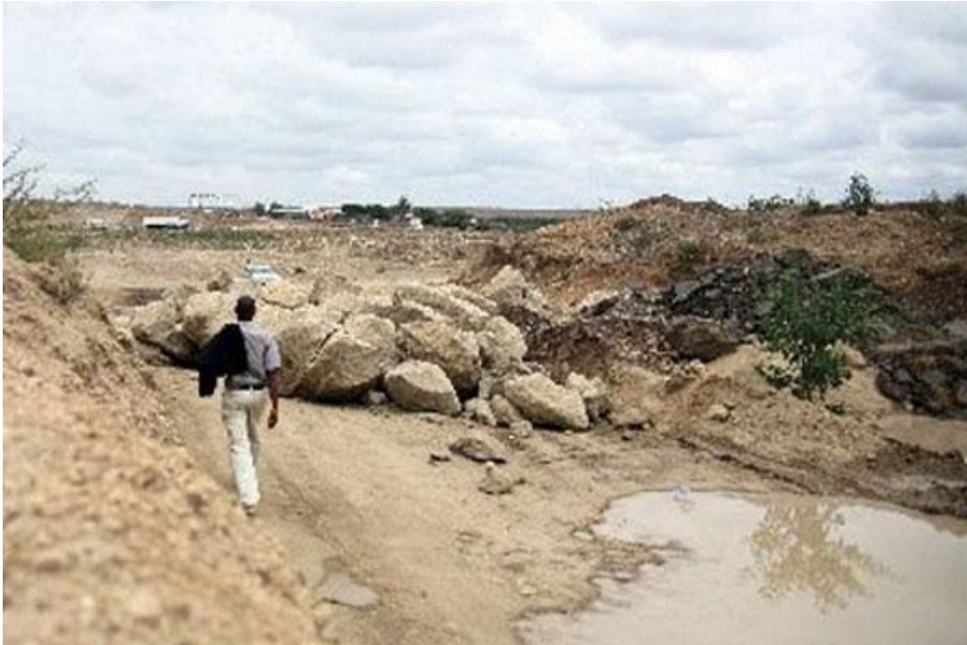
Plate 5.1: A section of River Athi. Makueni County government wants action taken against companies dumping waste in River Athi.

Punish firms polluting River Athi, says official