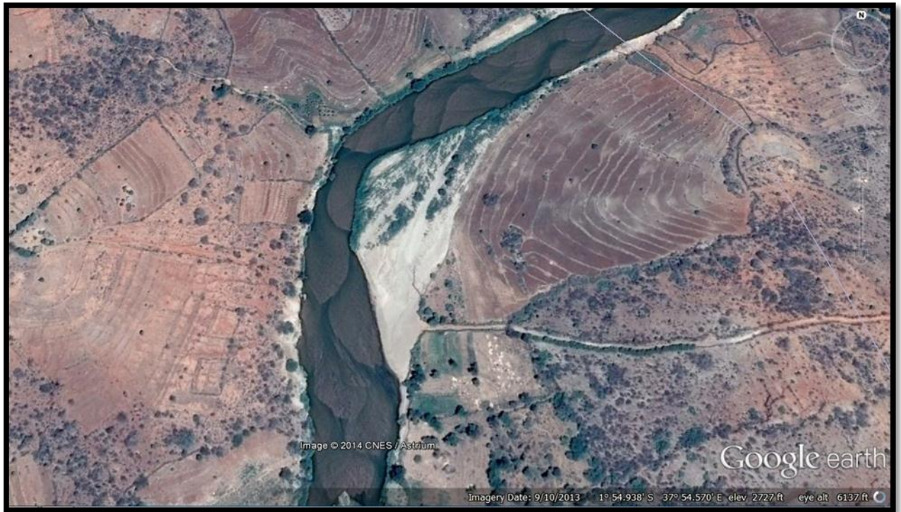
Figure 3.3: Google map of spatial human activities in study area