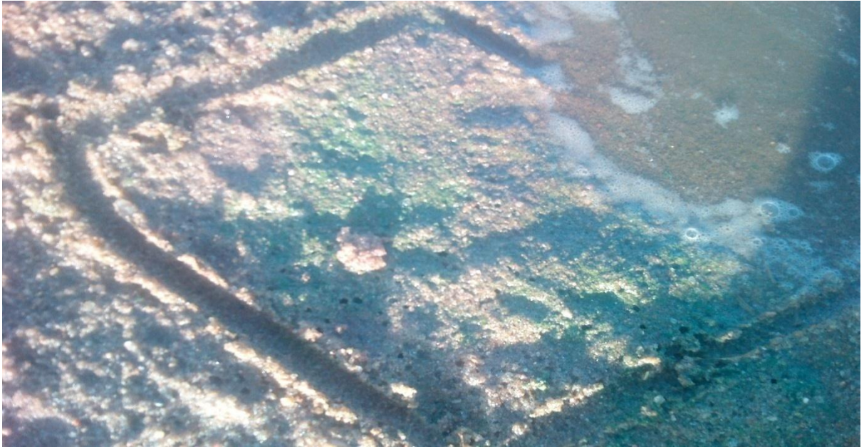
Plate 5.3: Photograph of a green colour (quadrant) left on the sand at the River Athi bed and below residents getting into the river to fetch water for domestic use (source?)

Five major causes of illness which included poor sanitation in neighbourhood, presence of mosquitoes, poor personal hygiene, and contact with river water and climate change were revealed. Contact with river water was the common cause of most illnesses. In Kwanyaa village (55.6%) of the household reported contact with the river water as the main cause of illnesses within them. Mumbeeni village and Kyase village both reported the same reason (50%) while Iiani village had 40% of the households. This could be attributed to people's belief that by living close the river for long period of time and advice from health personnel, they were bound to experience illness instances.