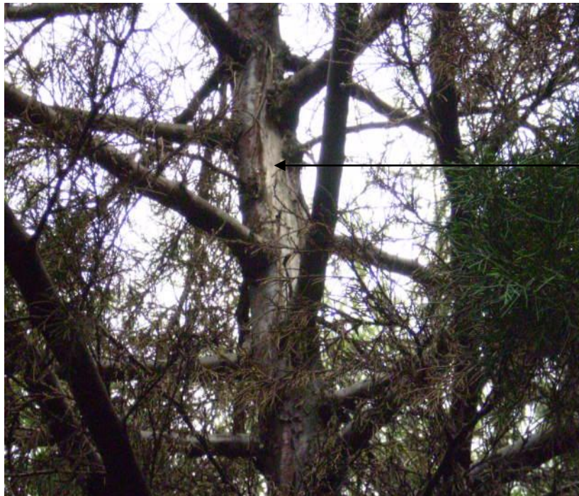
Debarking on the upper (3) part of a tree stem.