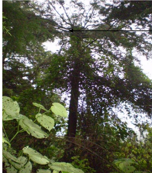
Epicormics following severe debarking and loss of apical dominance

It was however, difficult to estimate where the top was at the time of loss of apical dominance especially where new branches had already started to assume leader but have not grown to the position occupied by other stems in the stand canopy. Surveys done on the trees that had lost apical dominance but whose debarking was below the threshold (20%) had since recovered but assumed double leader status. Where debarking severity was above the threshold limit (20%), most stems remained epicormics (figure 3)