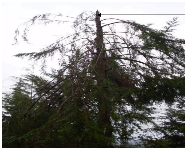
Loss of apical dominance due to debarking subsequently leading to a broken top and dieback

Debarking was found to impact negatively on the tree growth. However, the impact was only visible mostly on age cohort > 20 compared to 5-10 and 11-20 years. Sampled debarked trees in age cohort >20 showed loss of apical dominance and broken tops especially where debarking occurred in the upper (3) part of the tree (figure 2).