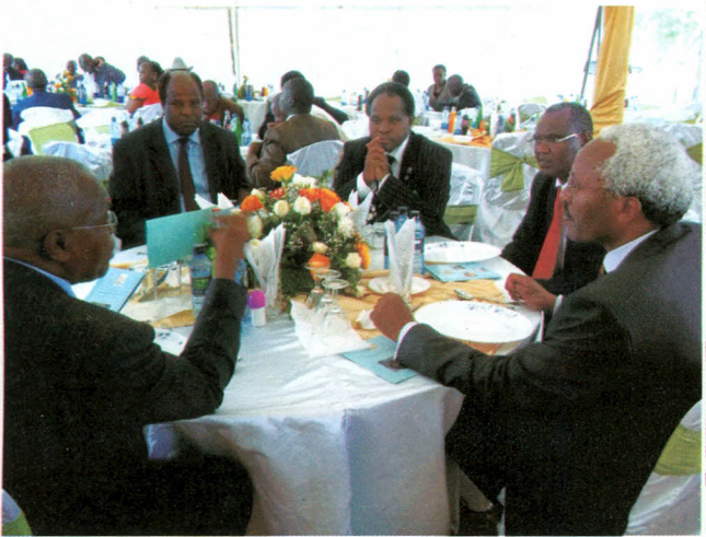
Guests at the Luncheon after the Launch of the Strategic Plan