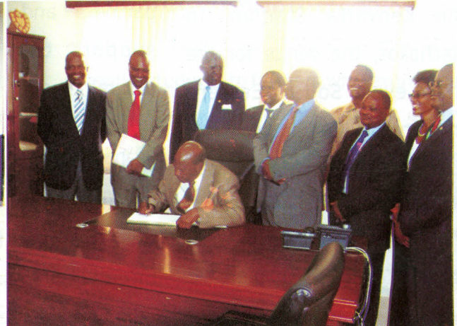
Chancellor signs visitors book