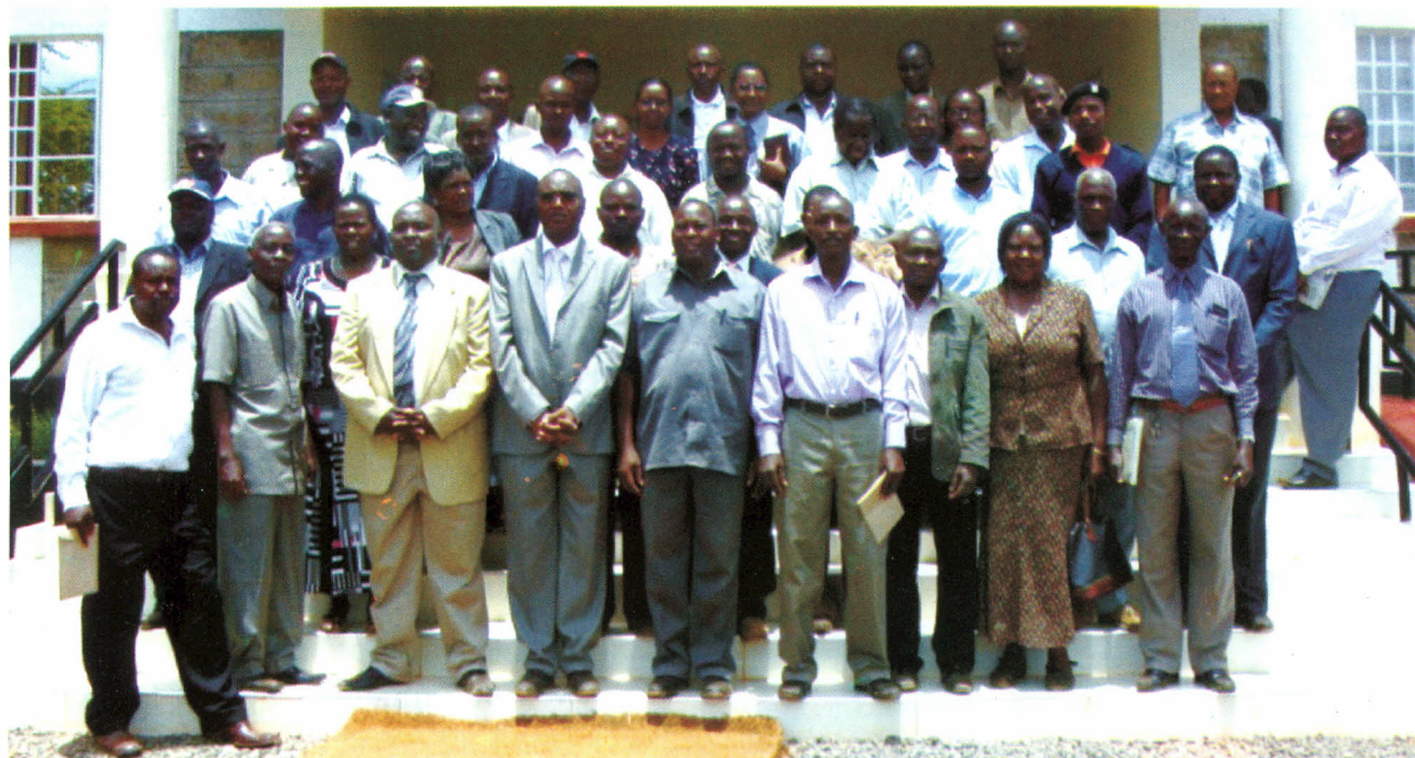
The SEUCO Management and the Kitui County Council members

Under the invitation of SEUCO Management, the Chairman, the Vice-Chairman and the Councilors of the Kitui County Council visited the institution on 30 th March 2011. SEUCO has a long history with the County Council of Kitui. The University College is a direct beneficiary of this relationship having inherited the 10, 000