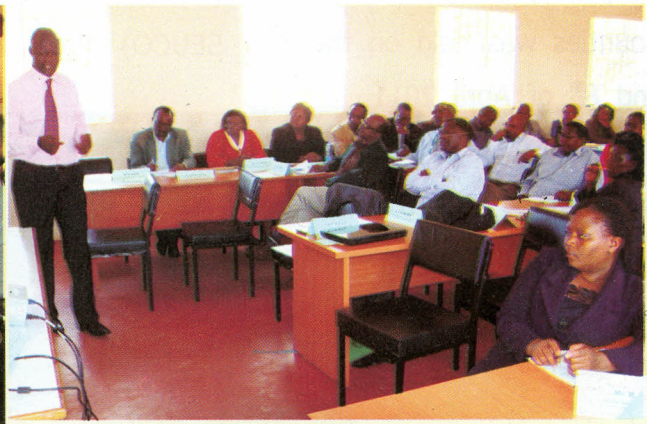
Performance contracting training