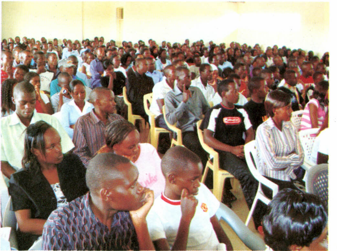
First year students listen to Principal during the Matriculation Ceremony