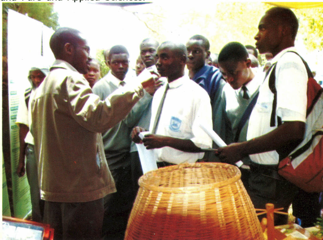
SEUCO staff attends to visitors in our stand.