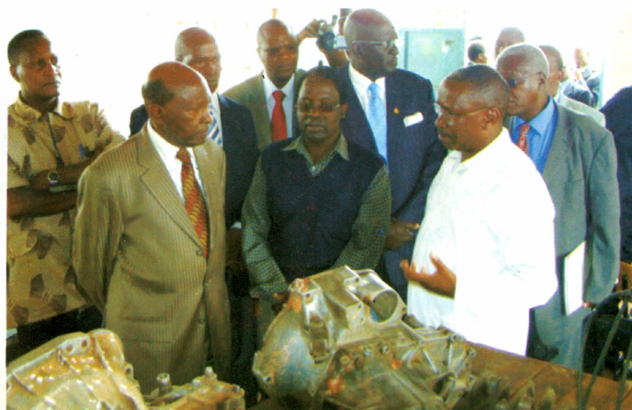
The Chancellor listens to the Dean, School of Engineering & Technology in one of their workshops

The Chancellor commended the University College Council and the Management for their commitment and speed in developing the