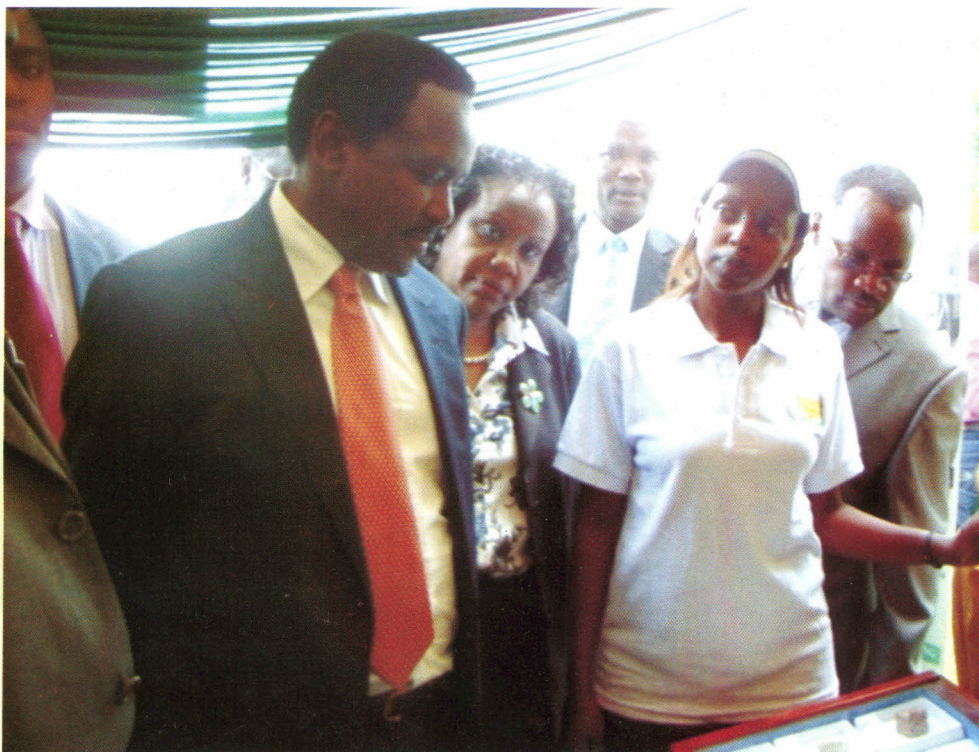
The VP Hon. Kalonzo Musyoka at the SEUCO stand