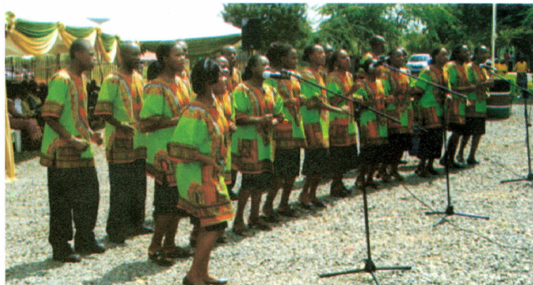
Student's choir entertaining guests during the launch of the Strategic Plan

B right uniforms and melodious harmonies were some of the hallmarks of the performances of the SEUCO staff and student choirs during the launch of the Strategic Plan on the 25 th of March 2011. The students' choir smartly dressed in green African Attire set off the day by leading the guests with the national anthem.