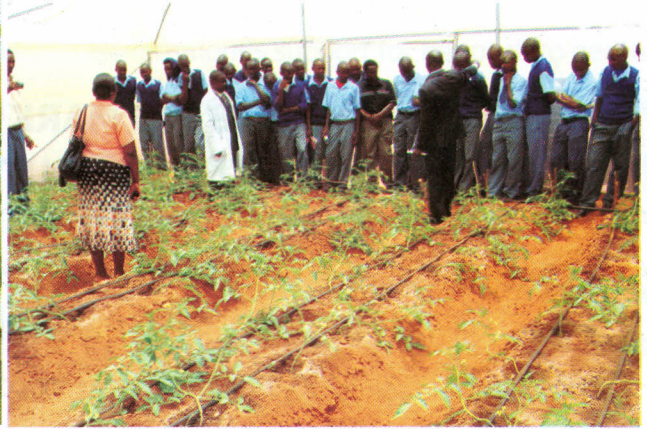
Nzambani Sec. visit Seuco