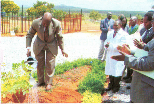
Chancellor plants commemorative tree