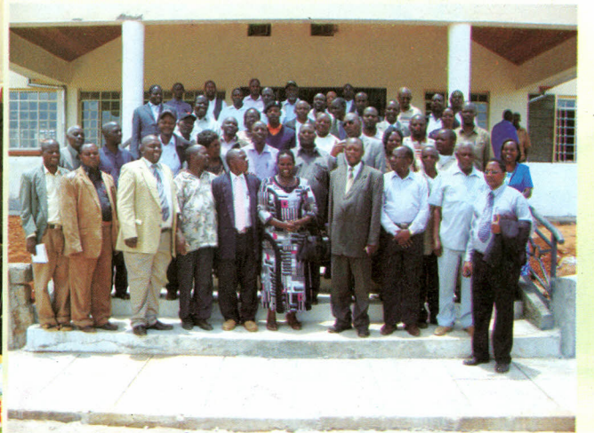
Kitui County Council chairman and Councillors during their visit to SEUCO