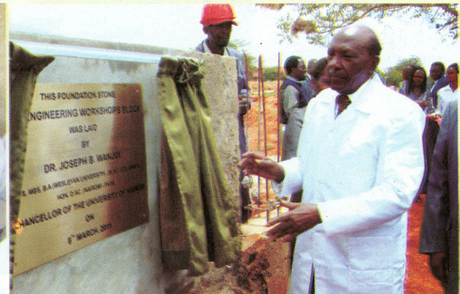
Chancellor opens workshop