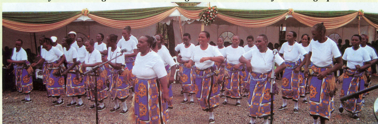
Ngwani dancers entertain guests on the launch of the strategic plan