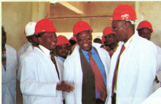
Chancellor tours university projects