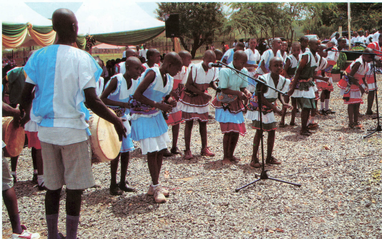
Nyumbani village children entertain guests on the launch of the strategic plan