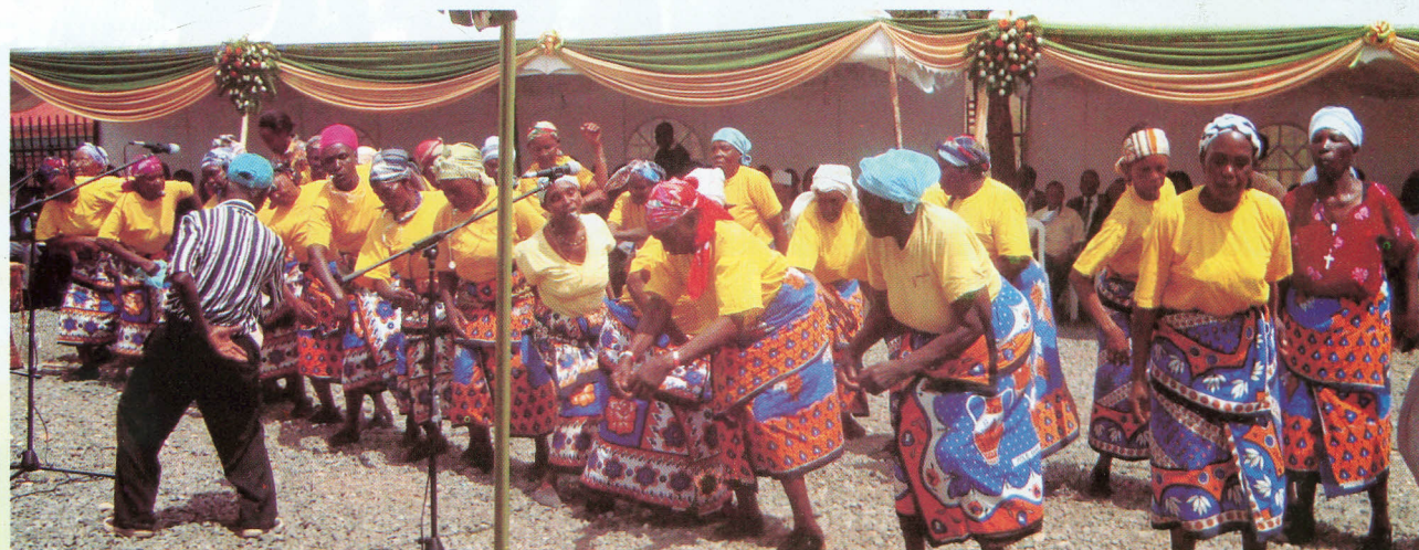
Nyumbani village children entertain guests on the launch of the strategic plan