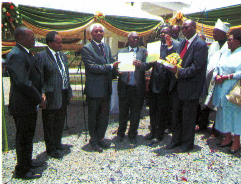
The PS MoHEST, members of the University College Council and Management display the Strategic Plan after its official launch

The PS urged the Department of geology in the school of Earth Sciences to focus on research aimed at identification and exploration of mineral resources in the region in line with Vision 2030 goals. Currently, the University College is in the process of signing a memorandum of understanding with the Kitui County Council for the mapping of the regions mineral wealth.