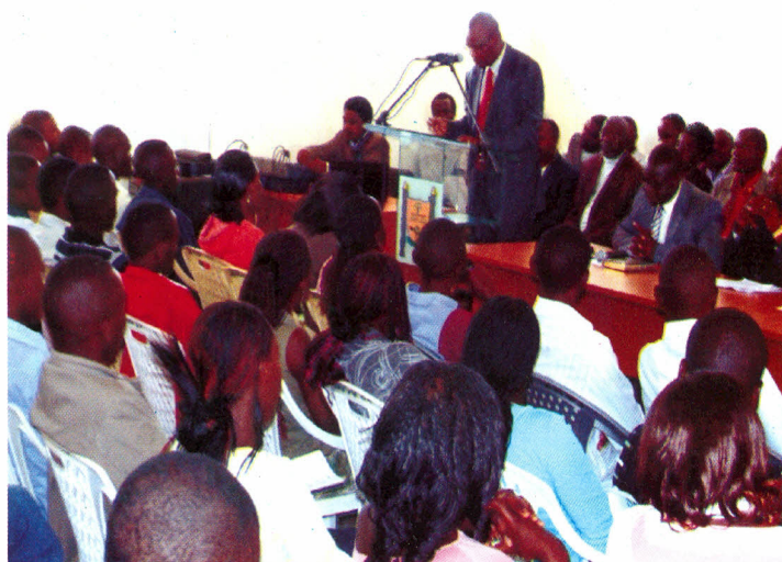
The Principal gives a speech during the matriculation ceremony

I n this life, we cannot succeed with just education alone to our name. Character is equally important. We should make it part of us to develop a character that each one of us would be proud