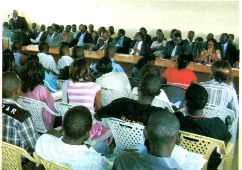
The Deputy Principal ASA addresses first year students during the matriculation ceremony.

The Academic Affairs Division has put in place strategies to fulfil the dream of the University College of becoming a fully-fledged University. New academic programmes have been introduced such as the Bachelor of Arts in