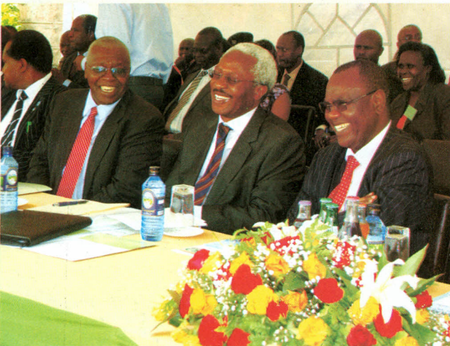
Principal, PS MOHEST and Council Chairman during the launch of the Strategic Plan