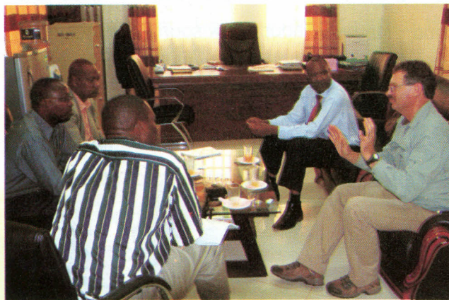
Guest from USA