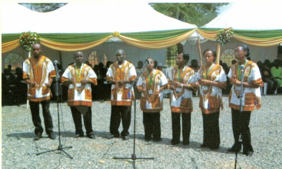
Staff choir making their moves during the Strategic Plan launch.

Other notable performances by the community around SEUCO that made the event colourful were the Nyumbani children's home and their caretakers and the Ngwani traditional dancers, who led the congregation in a dance to celebrate the launch of the strategic plan.