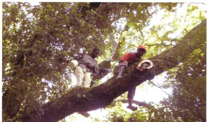
Destructive harvesting from colonies of stingless bees in Kakamega

Meliponiculture: beekeeping with stingless bees Bees for Development Journal 18