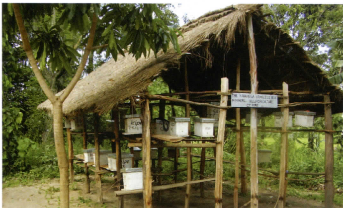
An established 'Meliponary' close to the Kakamega Rainforest