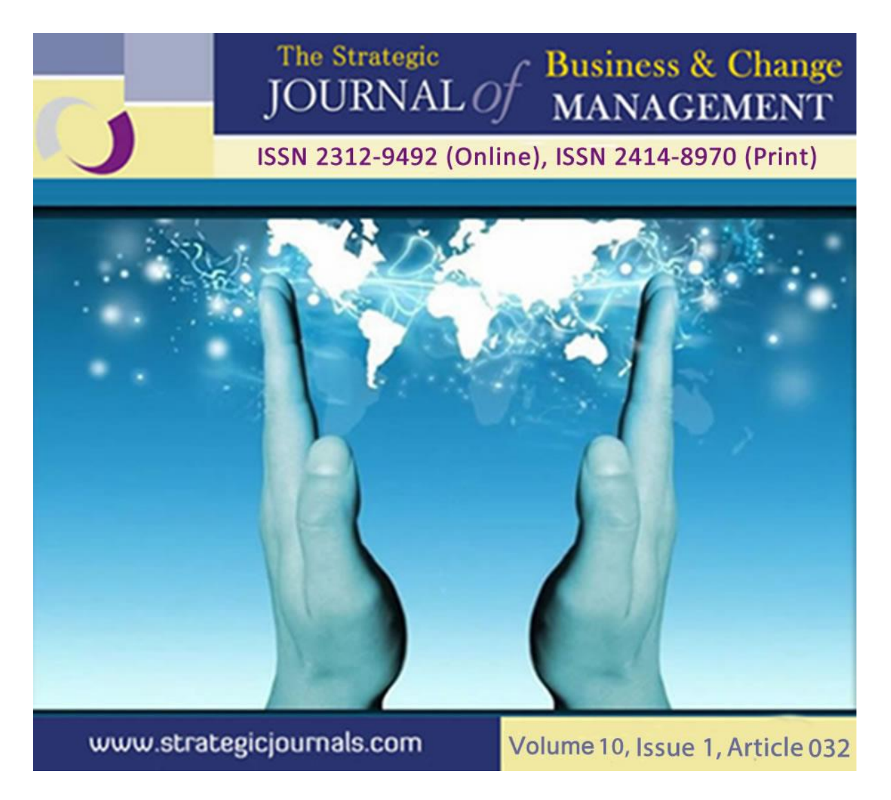
INFLUENCE OF PHYSICAL FACILITIES AND INSTRUCTIONAL MATERIALS ON THE TEACHING OF SPECIAL NEEDS LEARNERS IN PUBLIC PRIMARY SCHOOLS IN KENYA