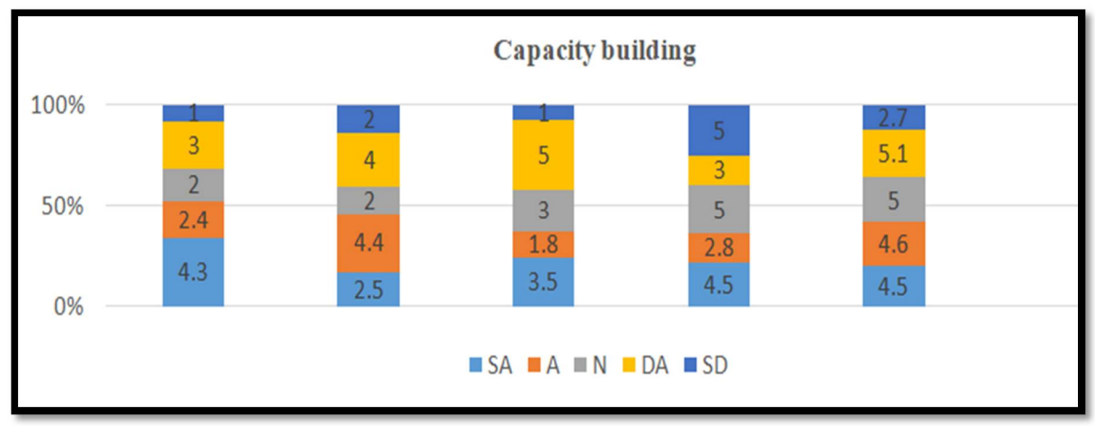
Figure 2: Measurement of Capacity Building Influencing Students' Academic Performance

Teachers were asked about the objective of Capacity building in a school and to indicate their views on the formulated statements, given in the questionnaire. The response of teachers on the capacity building and its influence on students' academic performance in view of capacity building and its effect on the performance of students' academic performance were analyzed and the results were presented in table 4.4 and further the results were captured in Figure 2 for showing clarity of the analysis.