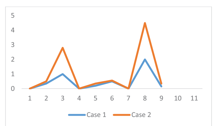
Figure 1.0: Power Loss in MODED with RE Vs Bus Position

where \lambda_c(t) the price of energy in time t, and P_{D,s}(t) is the load losses are significantly lower than in Case 2. From Table 3.0 the cost is highest in case 3 due to the increased cost of converters and inverter. The cost can be even significantly higher since the losses presented in this work are estimates (only network losses). However in case 2, the cost is significantly reduced.