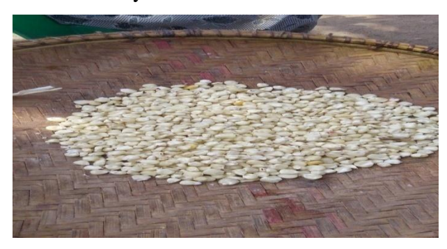
Figure 5: Sample of uninfected maize stored in a hermetic bag

Observations showed that households that utilized improved method of storage had cereal reserves which were not in any way affected. This suggests that improved method of storage plays a vital role in reducing post-harvest loss thus curbing hunger, poverty, and food insecurity.