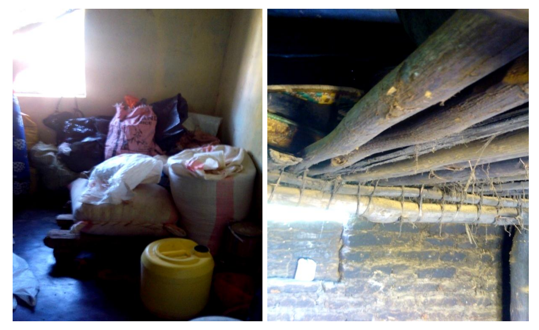
Figure 4: Gunny bags in a section of the house and utaa

Through observation it was evident that many respondents used a section of their houses to store their cereals. The respondents use gunny sacks to store their produce. Others utilized utaa . These forms of storage were not effective enough to protect the farmers maize from post-harvest loss. Figure 3, which depicts gunny bags in the house and utaa confirms the foregoing,