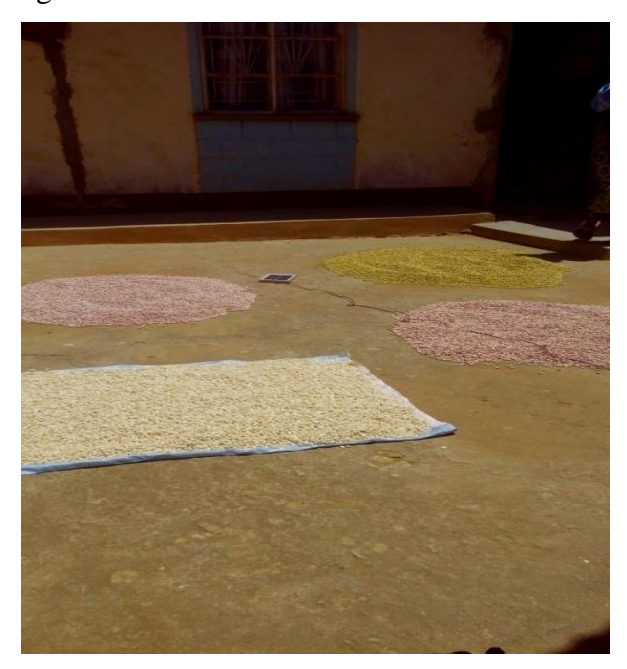
Figure 3: Sample of drying cereals by sun

From direct observation farmers relied on sun drying to dry their cereals as shown in figure 2