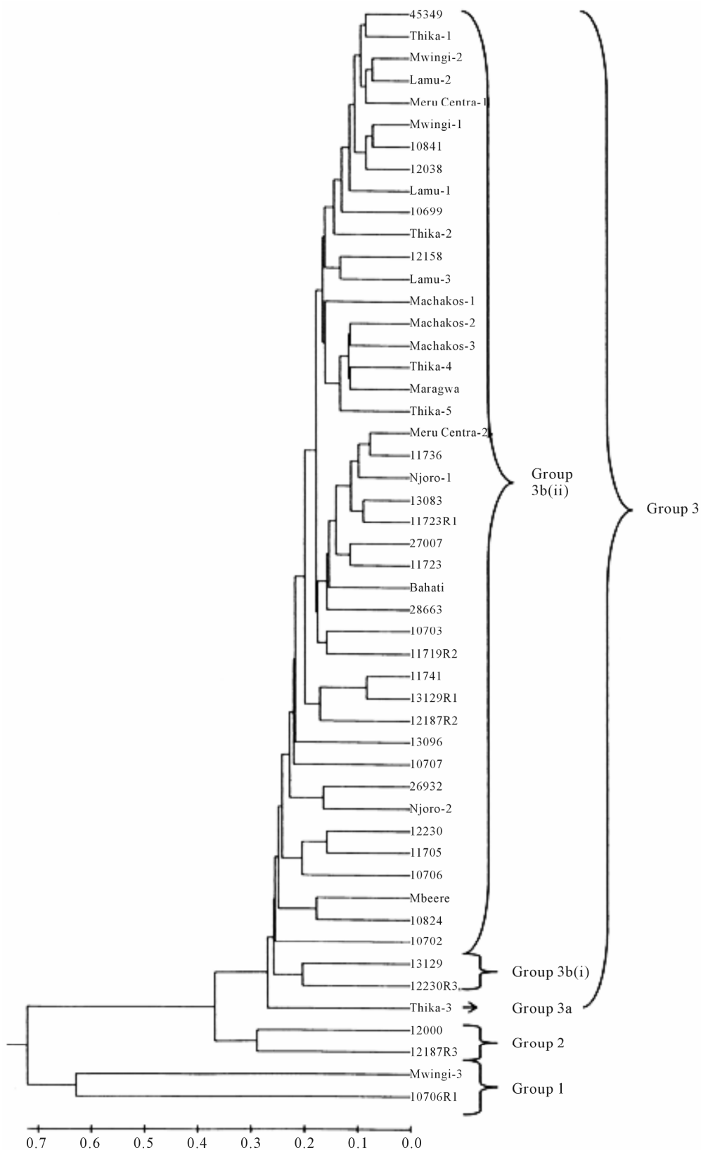
Figure 3. Relationship between 50 Kenyan L. purpureus accessions based on Nei's (1978) genetic distance using UPGMA method.